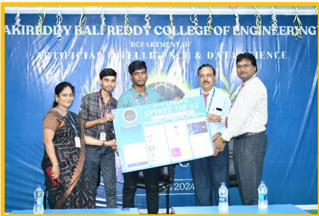
Unveiling the mobile app for Spirit of AI