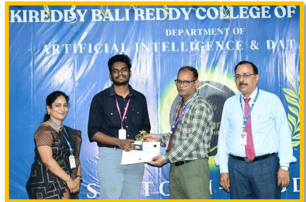
Certificate of Appreciation to the Winners