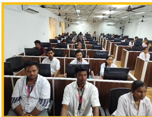
Artificial Intelligence Lab (Programming Languages Lab)