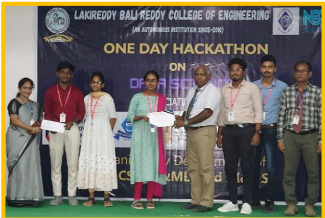
II Year Students Won 2 nd Prize in One day Hackathon in Data Science in 2023 by Brain O Vision.