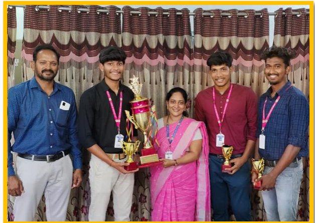
Our students won JNTU-K Central Softball